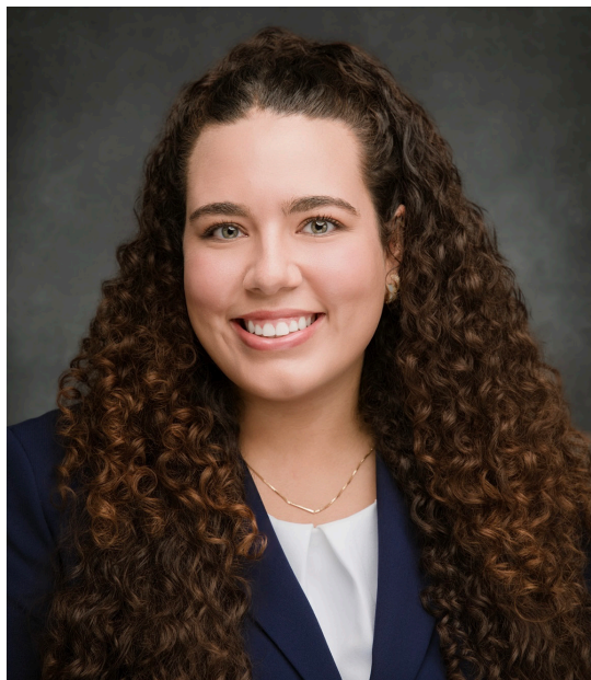
Master of Health Administration

First Community Village Endowed Scholarship