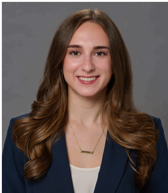
Master of Health Administration

“I am deeply grateful for your generous support through this fund. I grew up in the suburbs of Chicago and earned my biology degree from Purdue University before pursuing my master of health administration at The Ohio State University. My passion for health care began with a desire to make care more compassionate and efficient, especially in pediatrics, where I hope to improve access and experiences for children and families. This support lessens the financial burden and allows me to focus fully on learning and growing in the field. Your generosity is helping me pursue a career dedicated to ensuring every child can thrive, and I am truly honored to be a recipient. Thank you for investing in students like me and in the future of health care.”