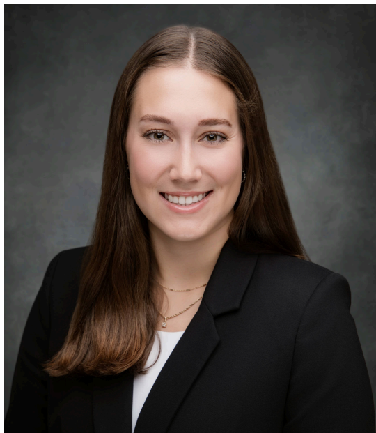
Master of Health Administration

“Thank you for the generous donation you made to help me further my education, I am extremely grateful to have been awarded this scholarship. I am from Youngstown, Ohio and graduated with my bachelor’s from Ohio State in May of 2025. From there, I decided to stay an additional two years to receive my master’s in health administration. I have loved Ohio State since childhood and am thrilled to have the opportunity to receive a second degree from this place I hold so close to me. Thank you again for creating this fund to help students like me further their education. I cannot wait to begin my career and make a difference in the world!”