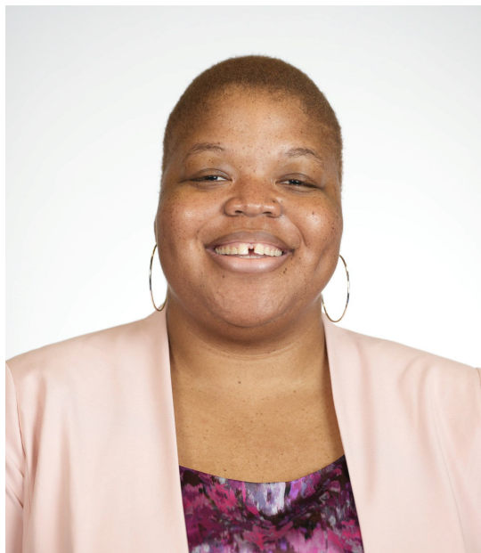
Doctor of Philosophy (PhD), Health Behavior and Health Promotion

Stanley Lemeshow Student Excellence Fund