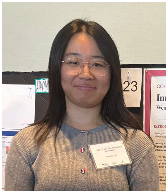
Master of Science, Biostatistics

The College of Public Health General Scholarship