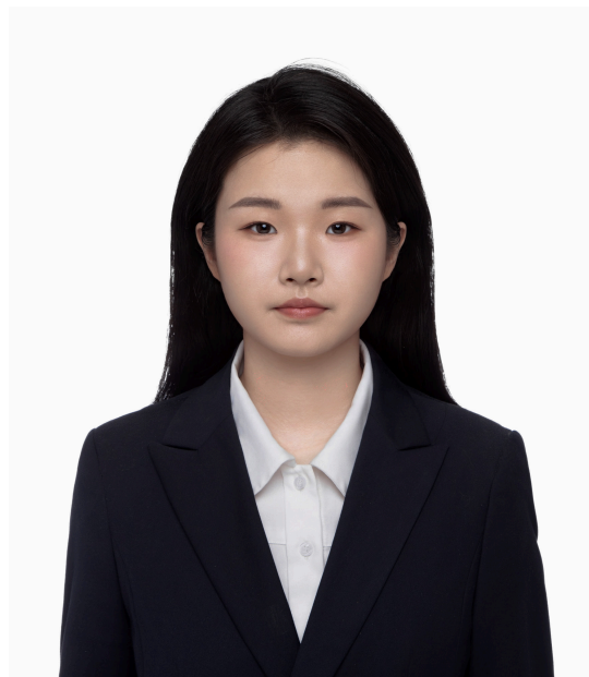
Master of Public Health, Epidemiology

The College of Public Health General Scholarship