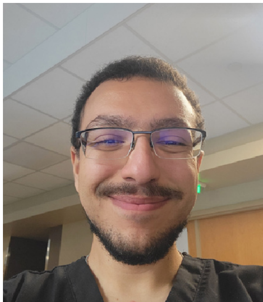
Master of Health Administration

Class of 1974 Distinguished Student Endowed Scholarship