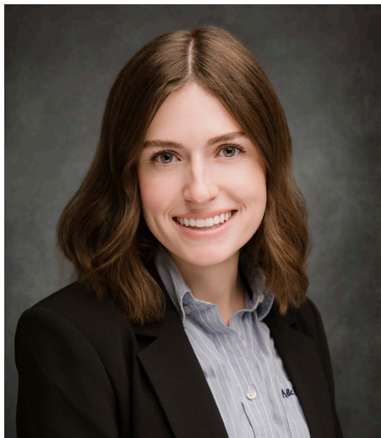
Master of Health Administration

“As a first-generation college student, receiving support has meant the world to both me, my family and my mentors who have inspired me throughout my career. Prior to starting my journey at Ohio State, I studied health administration at my alma mater, Utah Valley University. During this time, I gained exposure to the impact that positive, ethical and mission-based leadership could have on shaping health systems and caregivers. As an undergraduate student, I developed a passion for big picture thinking specifically within cancer care. Now, as a master’s student, these passions continue to live on. Within this first semester of my MHA, I have had the opportunity to be involved in case competitions, cancer-related projects at The James (Cancer Hospital) and have begun to foster amazing connections with my peers and alumni. Receiving a leading education from Ohio State will grow me into an effective and successful future executive. Thank you to all the wonderful donors of the College of Public Health.”