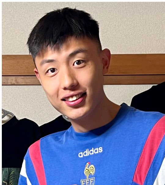
Doctor of Philosophy (PhD) in Biostatistics

Dr. Gary G. Koch and Mrs. Carolyn J. Koch Fellowship Fund in the Interdisciplinary PhD Program in Biostatistics