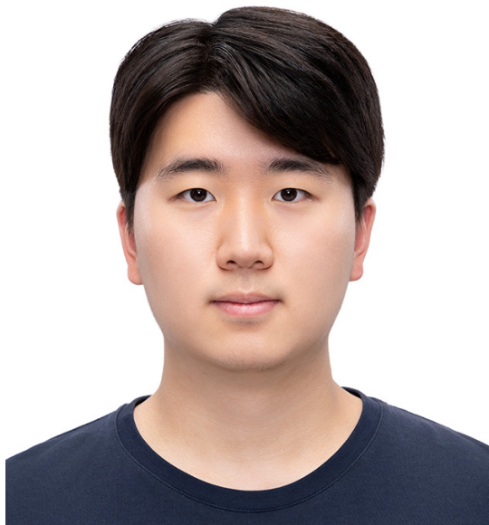
Doctor of Philosophy (PhD) in Biostatistics

Dr. Gary G. Koch and Mrs. Carolyn J. Koch Fellowship Fund in the Interdisciplinary PhD Program in Biostatistics