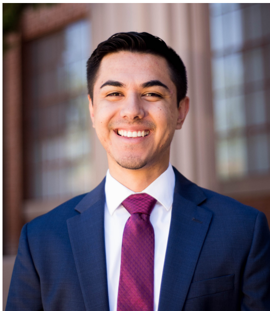
Doctor of Philosophy (PhD) in Health Services Management and Policy

Stanley Lemeshow Student Excellence Fund