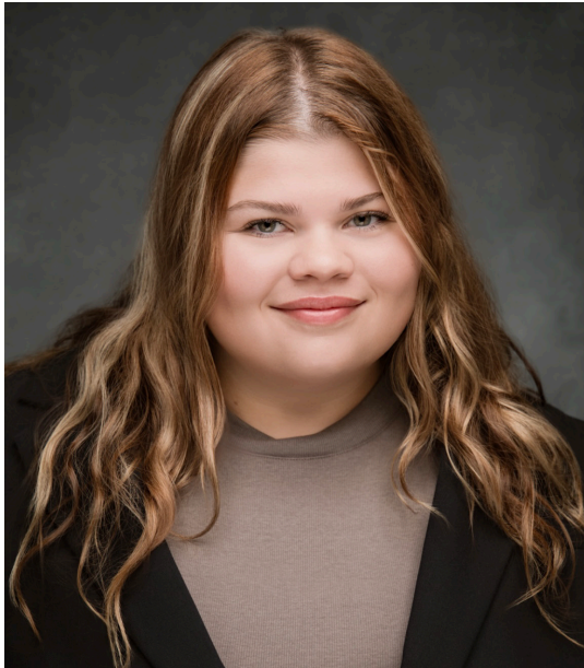
Master of Health Administration

First Community Village Endowed Scholarship