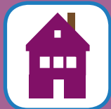
where we live