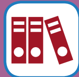
where we learn