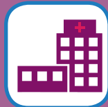
where we work